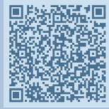
LLORET DE MAR - BLANES COASTAL ROUTE

This is one of our favourite activities when we're in Lloret de Mar.