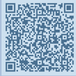
LLORET DE MAR - TOSSA DE MAR COASTAL ROUTE

It's one of our favourite stretches and such a wonderful way to start the day. We hope to cross paths with you if you've been convinced by our recommendation!